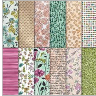
Share What You Love Specialty Designer Series Paper