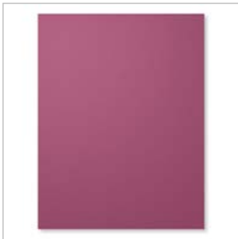
Rich Razzleberry 8-1/2" X 11" Cardstock