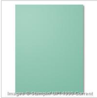
Mint Macaron 8-1/2" X 11" Cardstock