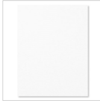
Whisper White 8-1/2" X 11" Cardstock