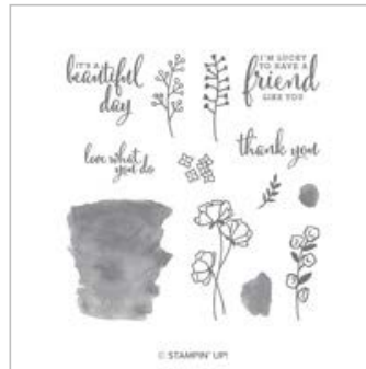
Love What You Do Photopolymer Stamp Set