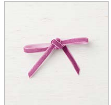
Rich Razzleberry 1/4" (6.4 Mm) Velvet Ribbon