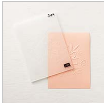
Lovely Floral Dynamic Textured Impressions Embossing Folder